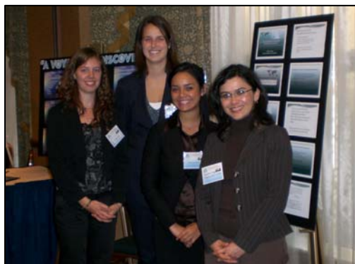
Clarion students share their international experiences at the annual PaCIE conference held this fall in Harrisburg