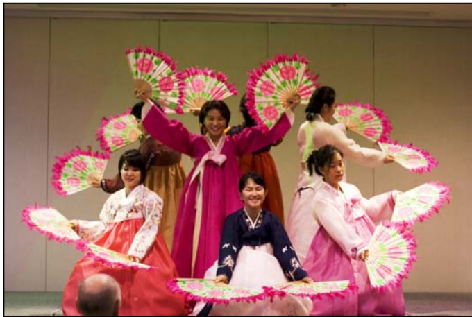
Korean Music performance during Global Temple Live! Concert featuring Temple Women's Ensemble

To help mark International Education Week, Temple University held its second annual Global Temple Conference on November 13, 2007. The all-day event celebrated the many international dimensions of Temple's students, faculty and staff in a variety of presentation formats. Ten of Temple's schools and colleges from five of its campuses were represented in the program as well as individuals who had participated on Temple's various international programs including India and Mexico.