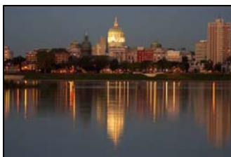
Plan to attend the 2007 PaCIE conference in Harrisburg!

A half-day post-conference workshop on Islam on Saturday, offered by the University of Pennsylvania's Middle East Center and South Asia Center, is designed for both teachers and administrators. Titled "Teaching About Islam and Politics in the Middle East: A