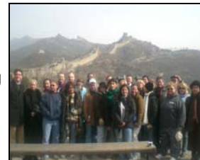
Lock Haven faculty on the Great Wall of China.

In addition to having the chance to meet with students and faculty members at the partner institutions in China, the delegation had the opportunity to experience many of the cultural and culinary highlights of Tianjin and Beijing, including a day-long visit to the Great Wall of China. A highlight of the visit to China was a reception and dinner held in Tianjin for the parents of students currently studying at LHU as well as friends and alumni of LHU living in China.