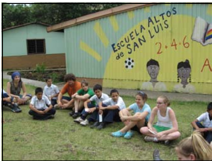
Honesdale High students visit elementary school in Costa Rica.

The trip and projects are a life-altering experience for the students, Ballew states. "They get to experience a rainforest, a cloud forest, a natural forest of regeneration, a volcano, a water fall, a cooperative organic farm for coffee production, a biological station for lodging, many hikes, a bat museum and several schools.