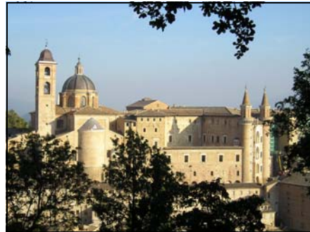
Villanova students will enjoy this beautiful vista during their semester in Urbino.